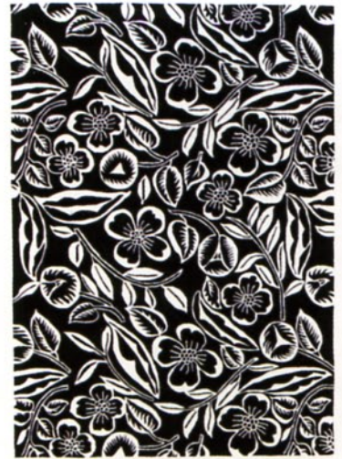
Capturing two of the major trends due to grace our interiors over the next few months, Kudos Flower's monochrome florals make the perfect complement to a wooden floors while offering cosiness. Expect to pay from around £255, at Home Temptations. Tel: 0870 428 0958. www.hometemptations.com