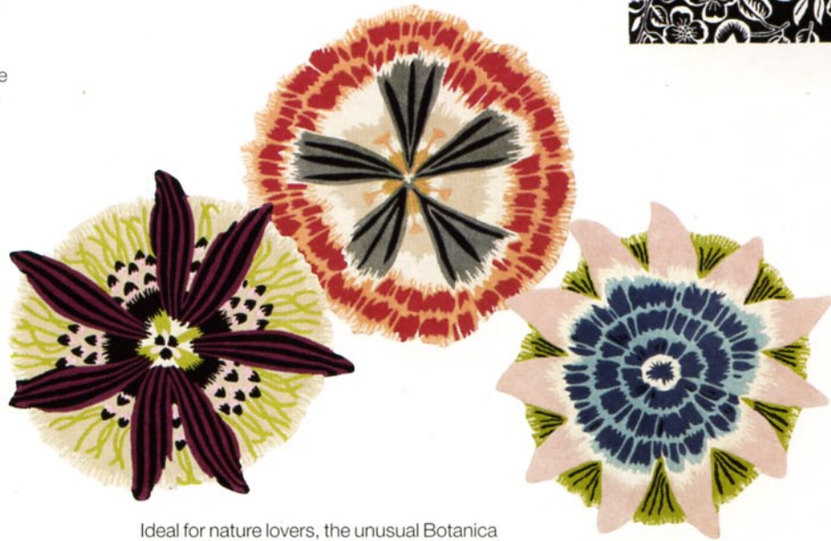
Ideal for nature lovers, the unusual Botanica by Missoni Home will instantly inject vibrancy into any setting. Prugna, Salomne and Blue, are made from 85% wool and priced £354 each, at Amara. Tel: 0800 587 7645. www.amara.co.uk