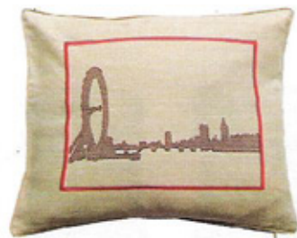
3_ GRAPHIC CUSHION