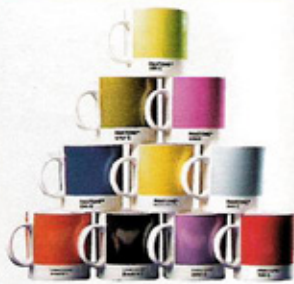
9_ RAINBOW MUGS