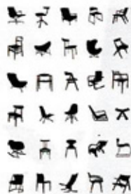
5_ FUNKY TEA TOWEL