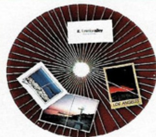
8_ DESIGNER NOTICEBOARD

10_ MUST-HAVE SIDEBORD We just want to run our hands all over this oak-veneered cabinet. £1,145, www.scp.co.uk