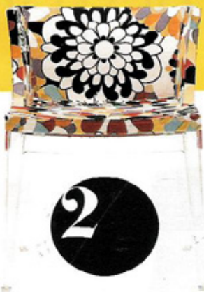
2_ PRINTED CHAIR