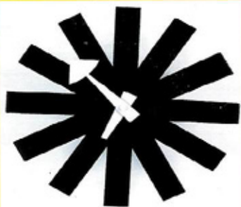
4_ RETRO CLOCK