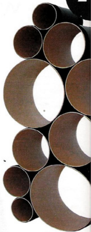
7_ CLEVER SHELVES