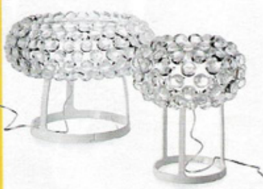
6_ STANDOUT LIGHT