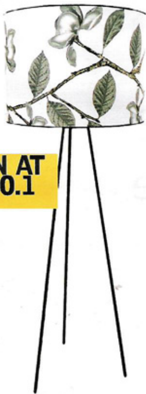
1_ FLORAL LAMP