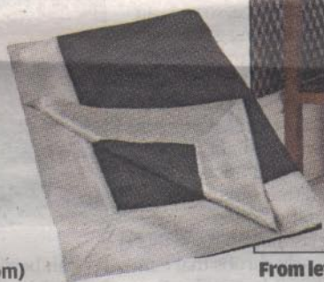
From left to right: silver Ravenna wallpaper, £42.30 a roll; Colombina paper

Glitzy: J by Jasper Conran metallic- edged throw, £75 (0844 561 6161; www.debenhams.com )