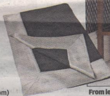
From left to right: silver Ravenna wallpaper, £42.30 a roll; Colombina paper

Glitzy: J by Jasper Conran metallic- edged throw, £75 (0844 561 6161; www.debenhams.com )