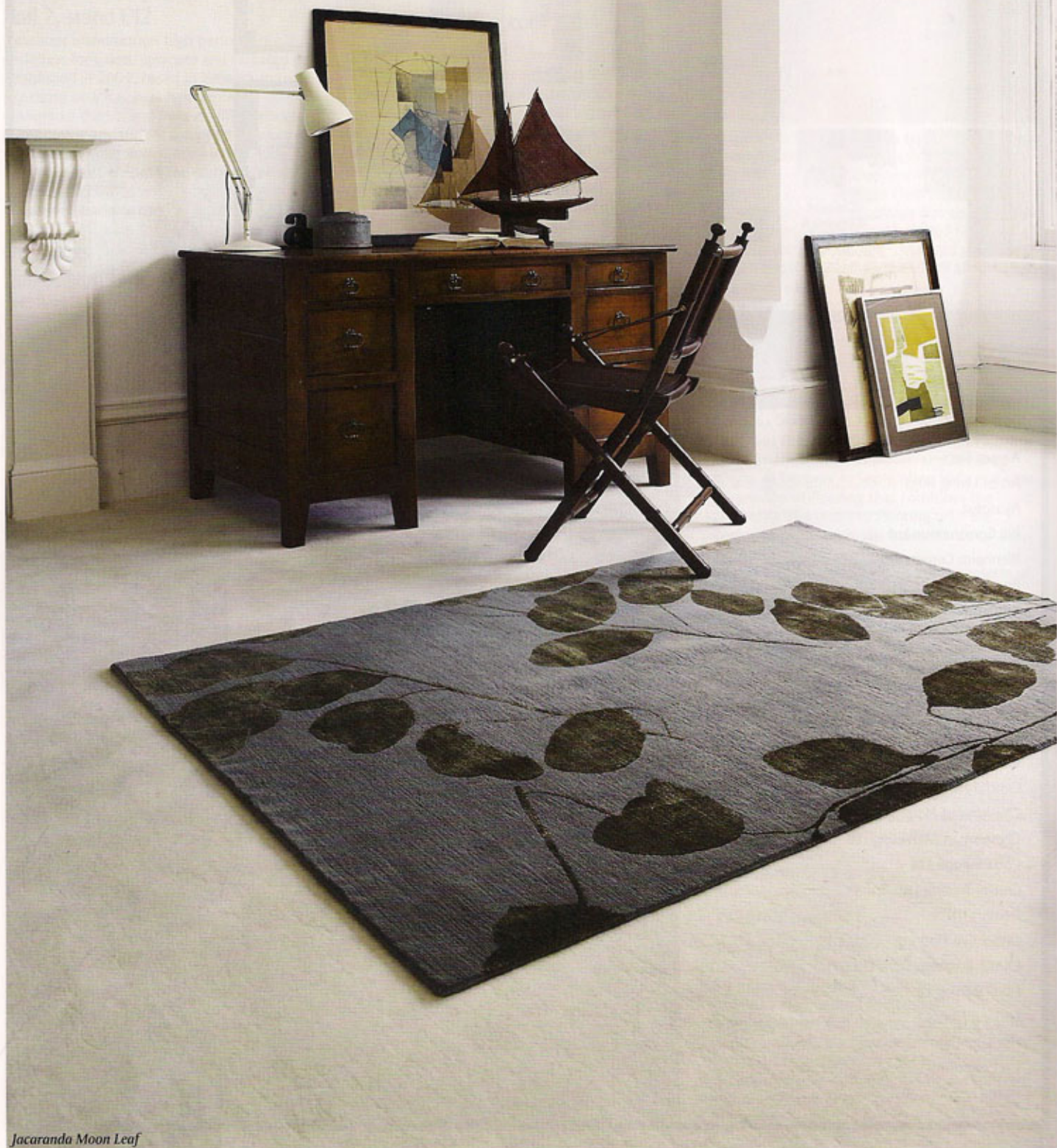
Jacaranda Moon Leaf