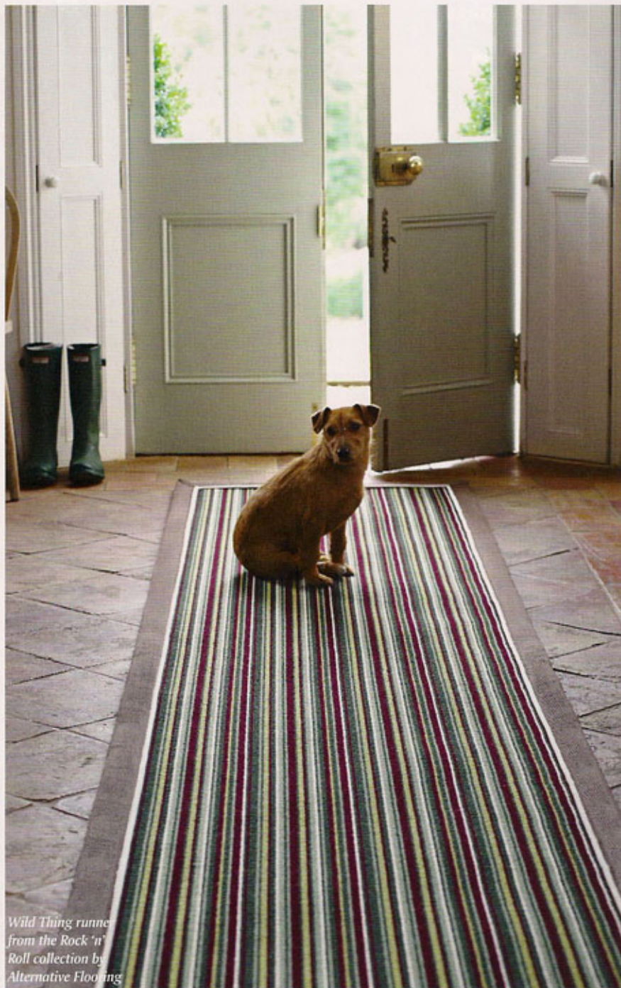
Wild Thing runner from the Rock 'n' Roll collection by Alternative Flooring